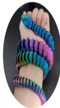
Snakes & Spiders